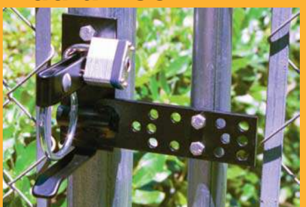
Any padlock can be used to lock the gate.