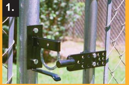
1. The gate swings closed and the striker bar hits the ring.