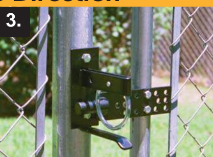
3. The ring drops down and the gate is shut and SECURE.