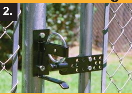
2. The ring rolls up.