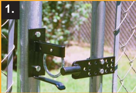
1. The gate swings closed and the striker bar hits the ring.