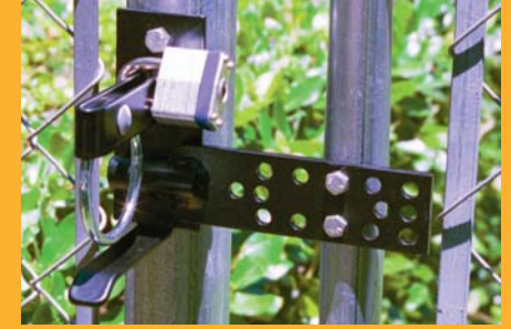
Any padlock can be used to lock the gate.