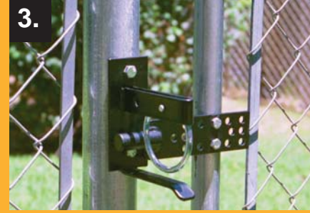
3. The ring drops down and the gate is shut and SECURE.