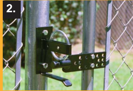
2. The ring rolls up.